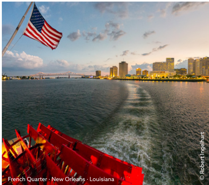
French Quarter · New Orleans · Louisiana