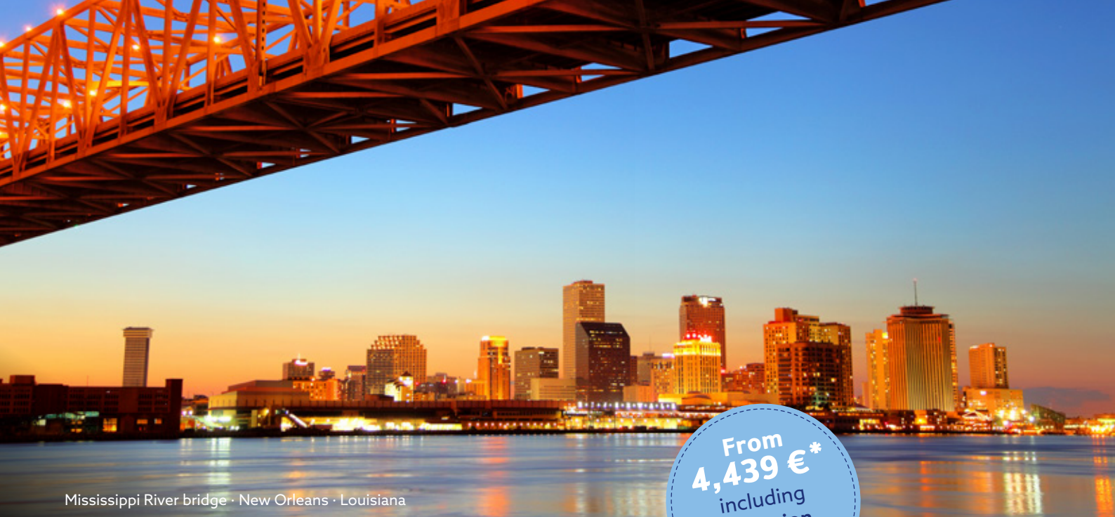
Mississippi River bridge · New Orleans · Louisiana

From 4,439 €* including excursion programme