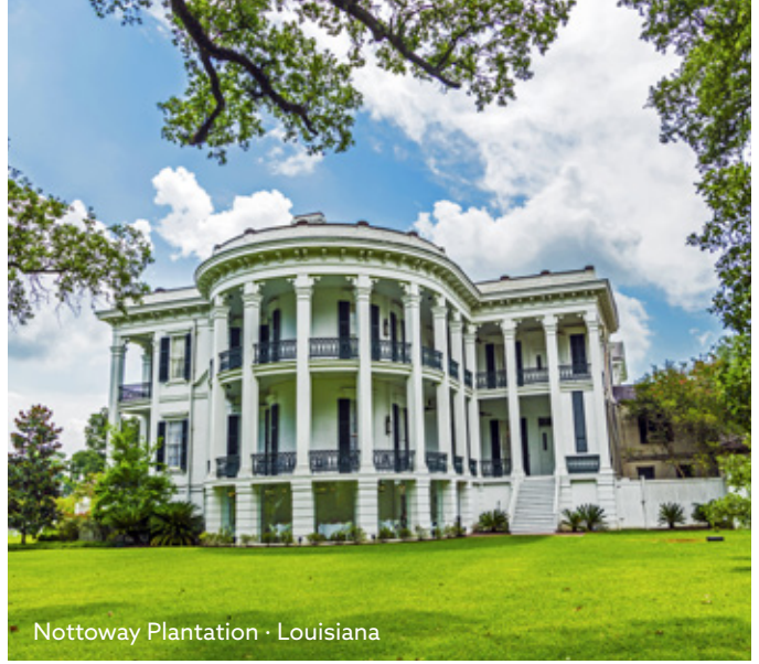
Nottoway Plantation · Louisiana

After breakfast, a hop-on hop-off bus tour will take you to three special attractions. The Old Market Hall was built in 1819 and is used today as a market centre. Shop for clothes or jewellery and treat yourself to a