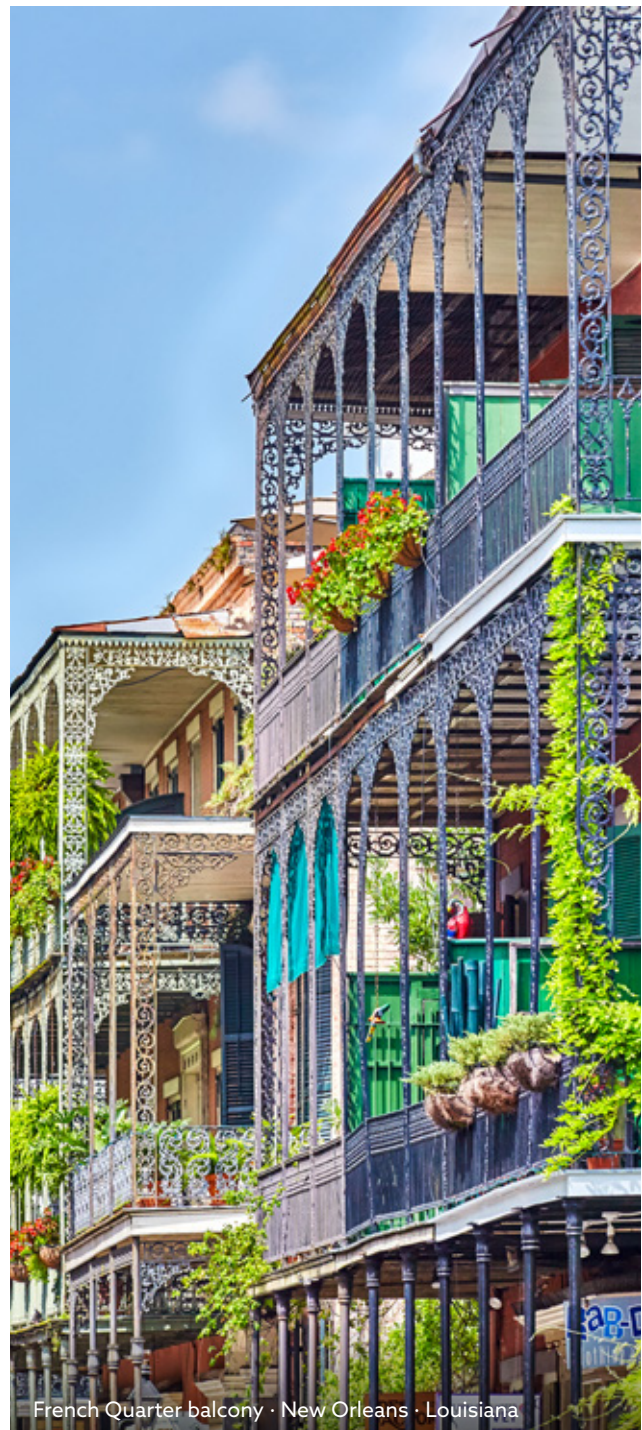
French Quarter balcony · New Orleans · Louisiana

After breakfast, you will check out of your hotel. We are sure that you will take many pleasant memories home with you.