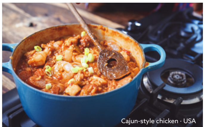
Cajun-style chicken · USA

Your hop-on hop-off tour begins in the morning and will bring you to the best sights in Natchez. Visit the Old South Trading Post and try a variety of culinary treats: Jams, muscadine grape juice and numerous different coffee specialities. Then you are off to the historic Rosalie Mansion with its federal-style architecture. Tour the mansion, its expansive gardens, kitchen, library and the carriage house on your own and learn about its fascinating history. There are also two additional mansions that you can visit. Magnolia Hall was constructed in 1858 and Stanton Hall in 1857. Both were built in the Greek revival style. During the bus tour you can learn more about this city on the river while visiting the Natchez Visitor's Center . The last stop before returning to the AMERICAN QUEEN is the Museum of African American History and Culture , where you can learn all about African-American history.