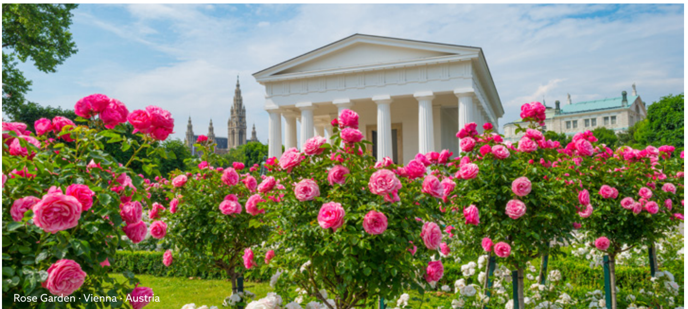
Rose Garden · Vienna · Austria

Deck plan nickoSPIRIT see page 54 (ship profile on page 138)