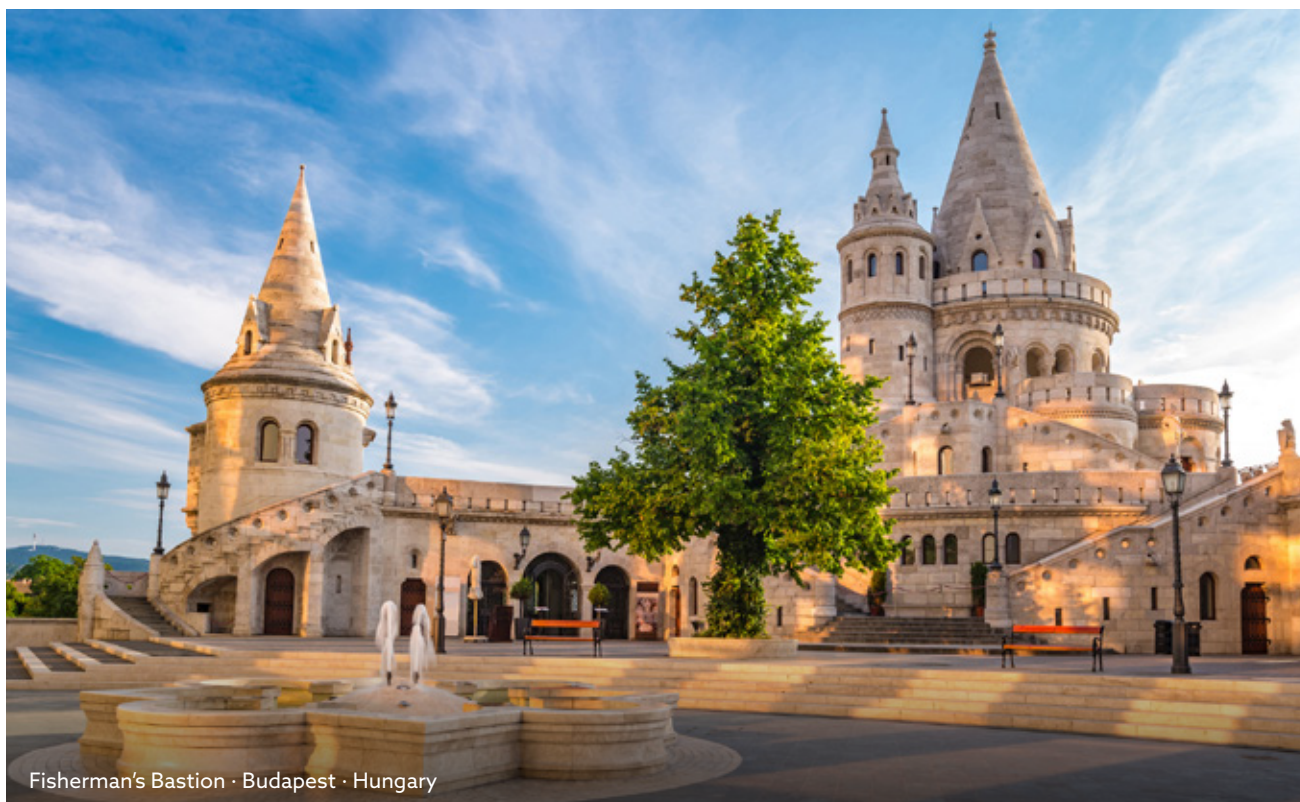
Fisherman's Bastion • Budapest • Hungary

An authentic experience of Hungary on the "Budapest by Night" tour.