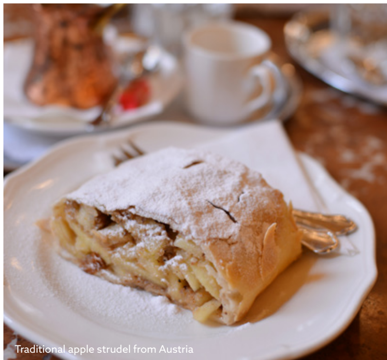
Traditional apple strudel from Austria