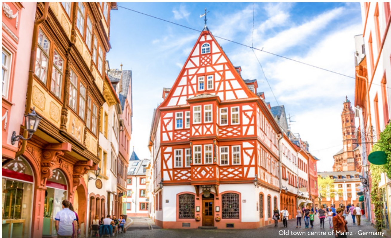
Old town centre of Mainz • Germany

Take a journey back in time in the delightful old town centre of Mainz.