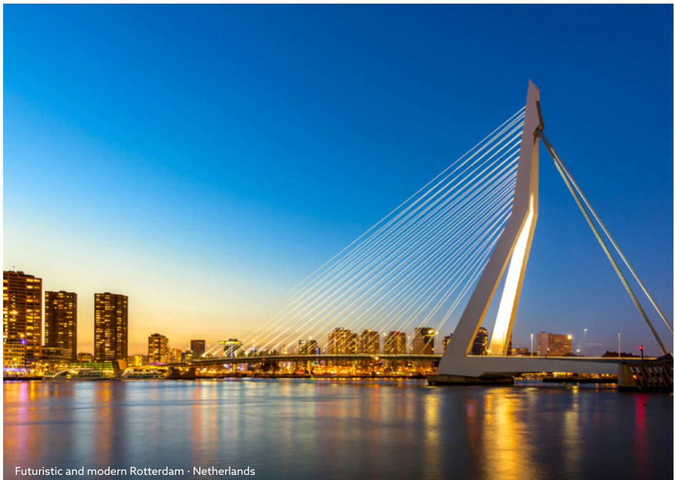
Futuristic and modern Rotterdam • Netherlands