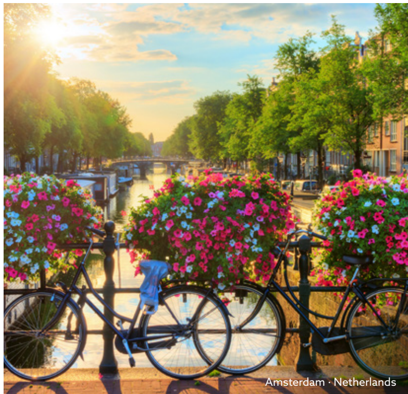
Amsterdam · Netherlands