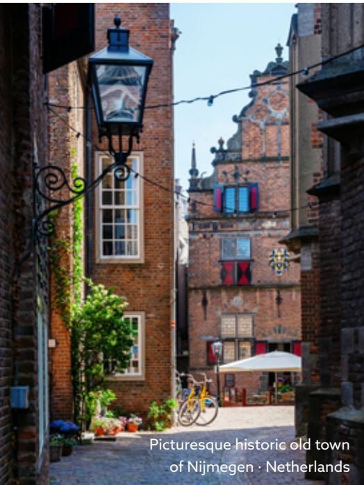
Picturesque historic old town of Nijmegen · Netherlands