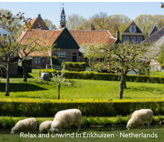
Relax and unwind in Enkhuizen · Netherlands