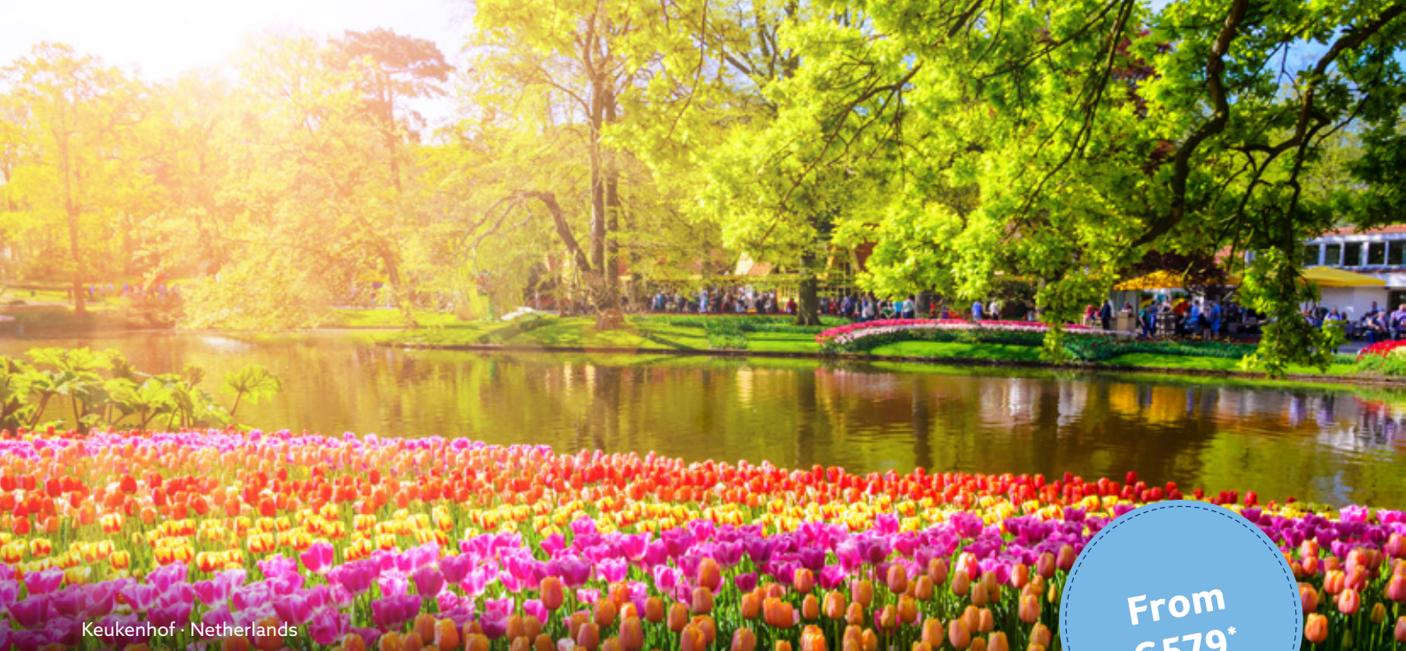
Keukenhof · Netherlands