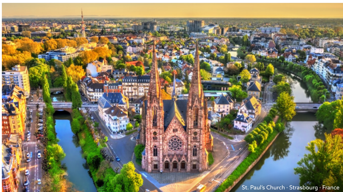
St. Paul's Church · Strasbourg · France

"Siegfried's Mechanisches Musikkabinett" – historical inventions that will amaze you