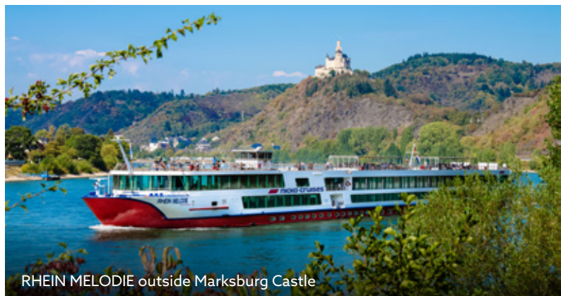
RHEIN MELODIE outside Marksburg Castle