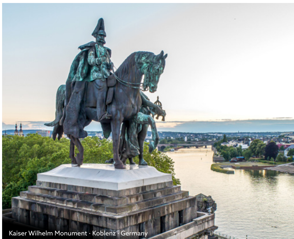
Kaiser Wilhelm Monument • Koblenz • Germany