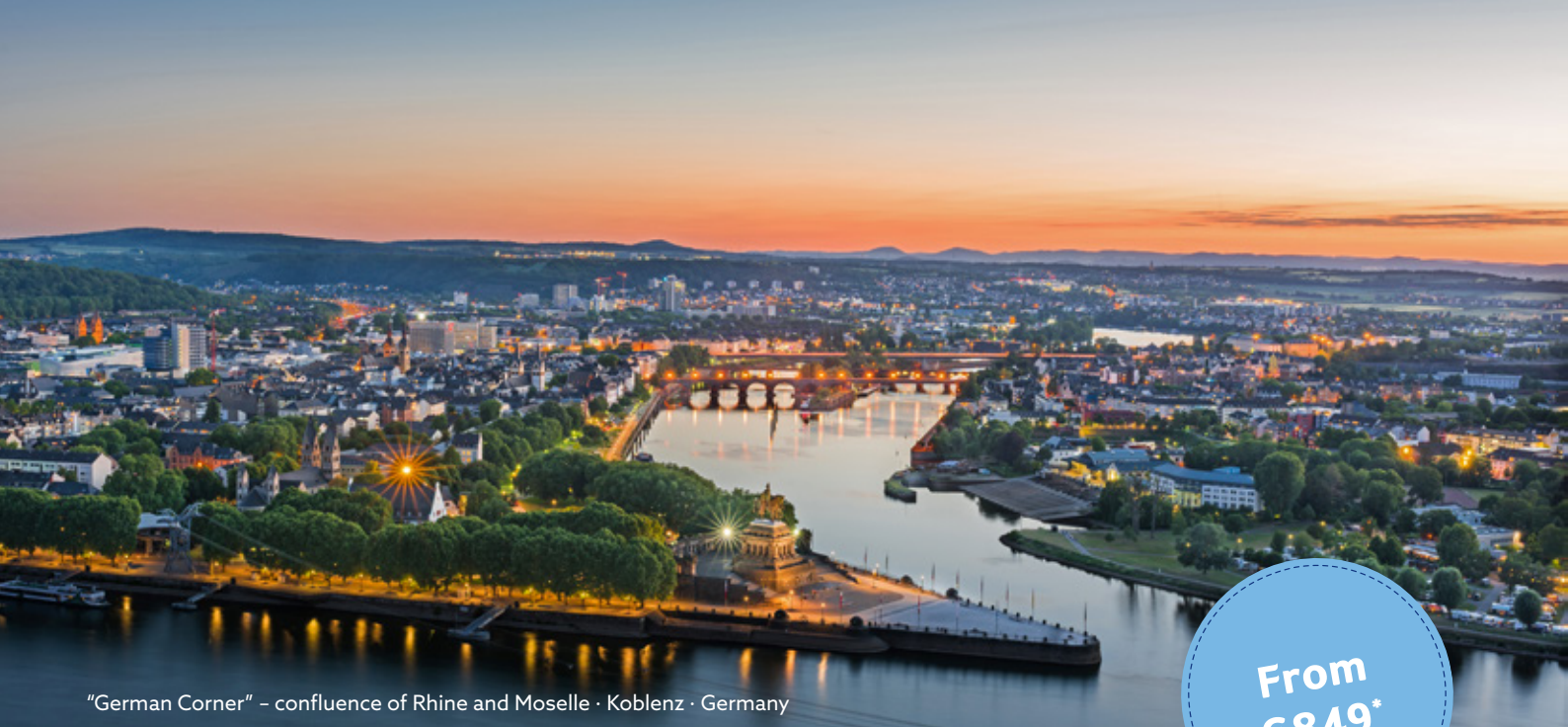
"German Corner" – confluence of Rhine and Moselle · Koblenz · Germany