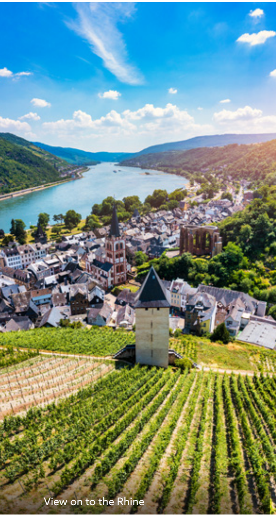
View on to the Rhine