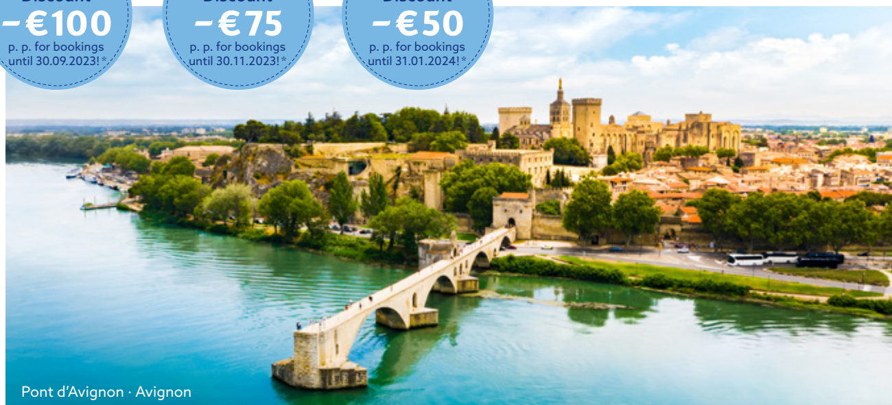
Pont d'Avignon • Avignon