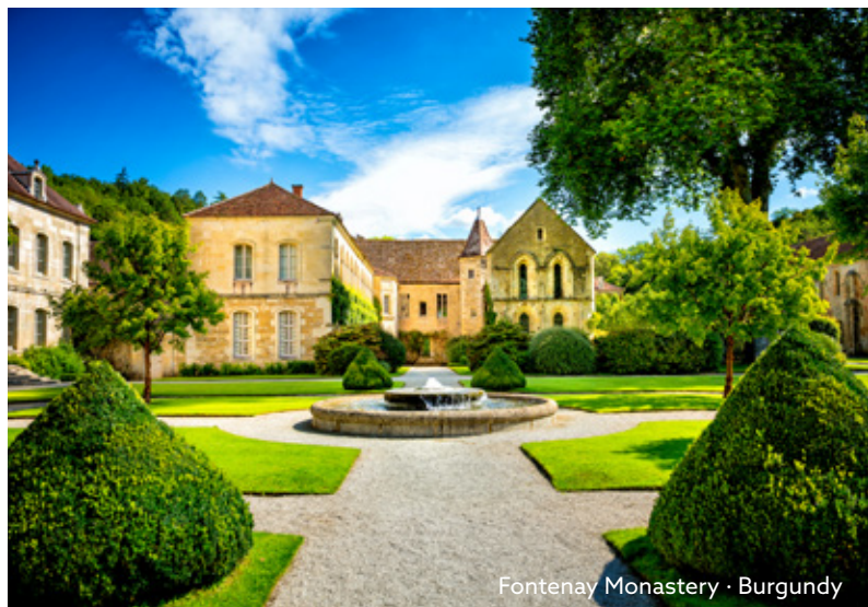
Fontenay Monastery · Burgundy

* €100 Ultra Early Booking Discount until 30.09.2023.